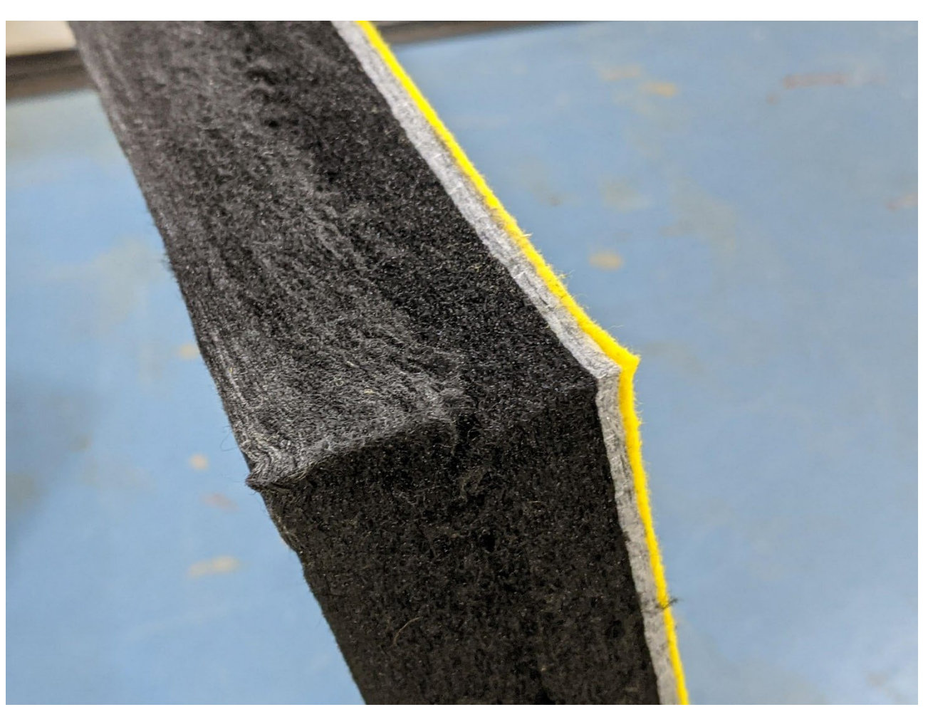
Figure 3 – Detail of specimen materials