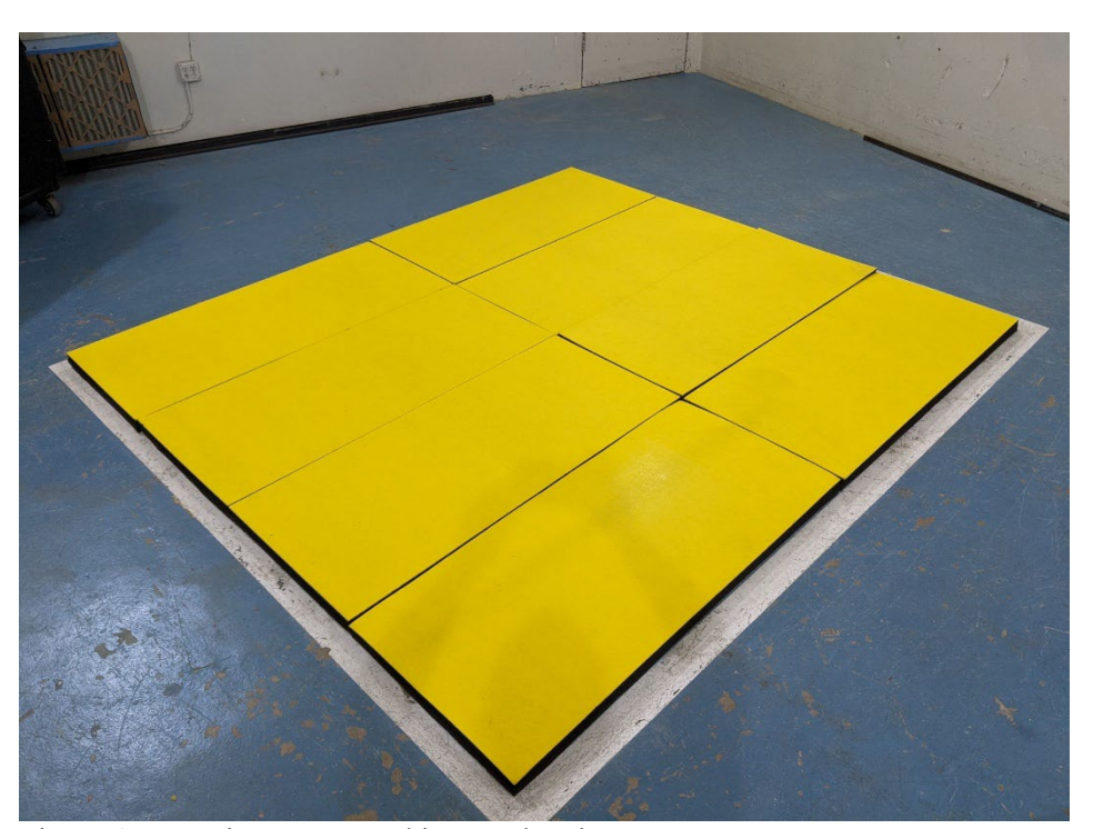
Figure 1 – Specimen mounted in test chamber